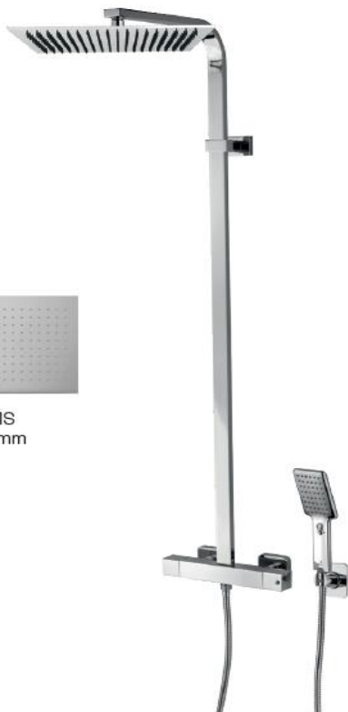
100877 TETIS 400 X 250 mm